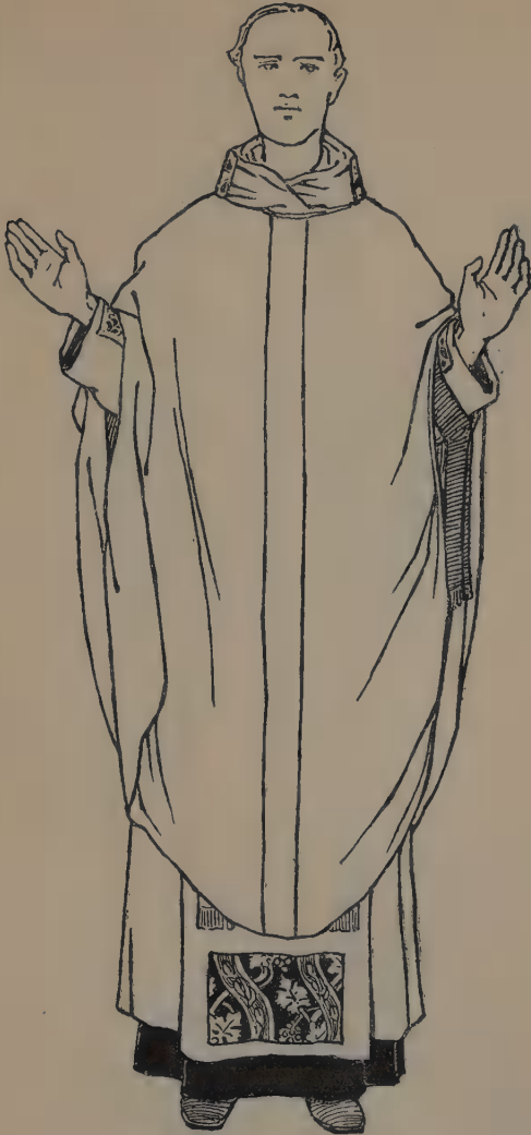
PRIEST IN CASSOCK, AMICE, ALB, GIRDLE, MANIPLE, STOLE, AND CHASUBLE.